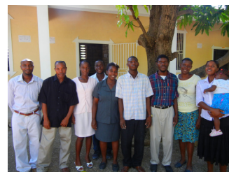
Fisherman School Teachers

"My command is this: Love each other as I have loved you." John 15:12